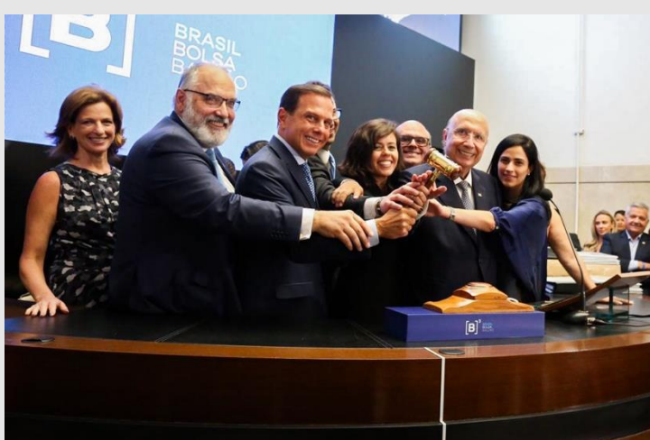
In the picture, Governor João Doria and part of his secretariat hit the hammer at the PIPA auction.