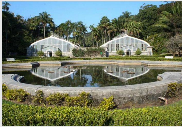
In the picture, the Botanical Garden Alberto Lofgren

The project sets the opening of a promising sector, the concession of environmental assets that not only aim for improving the infrastructure to the public, but also to contribute to the social and environmental development through promoting conservation, education and leisure. The public hearings are scheduled to be held in the next two months.