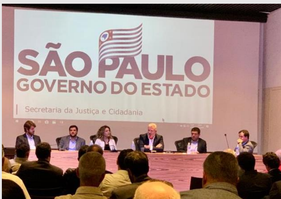
In the picture, public hearing on the Lines 8 and 9 concession Project.