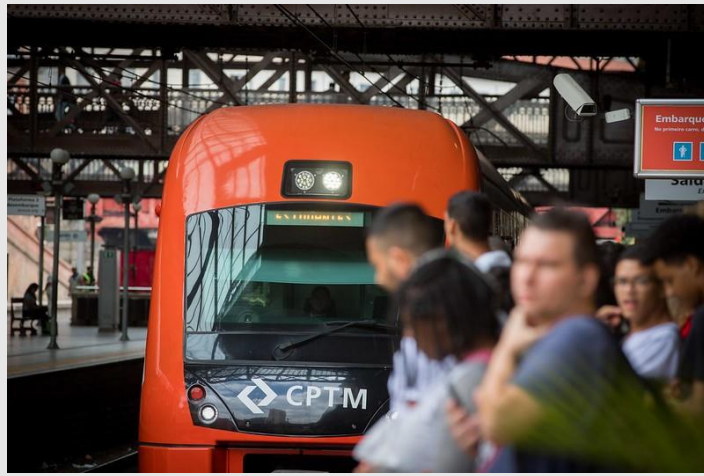
In the picture, station of line 8-Emerald

After its final modeling was approved by the Directing Council of the State Privatization Program (CDPED), the Request for Proposals, Contract and other bidding documents for the concession of Line 8-Diamond and 9-Emerald were published on December 1st. The publication of the documents is another step of the Government of the State of São Paulo in the direction of a vigorous economic recovery, guaranteeing investments of more than R $ 3 billion in a clean and efficient alternative of urban transport. The project arouses great interest from the national and international market due to the robustness of the modeling, developed through constant dialogue with stakeholders, and incorporation of good international practices. The public envelope opening session is scheduled for the 2nd of March of 2021 at the headquarters of Brasil Bolsa Balcão - B3 at the address: Rua XV de Novembro, 275. The documents can be found at the link: http://sis.cptm.sp.gov.br/DataRoom/