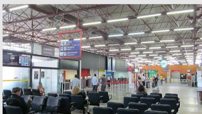
In the picture, hall of São José do Rio Preto's airport.

Having its final modeling approved by the Directing Council of the State Privatization Program (CDPED), on April 15 th of 2021, the International Competition Notice No. 01/2021 was published, referring to the concession of 22 regional airports in the State of São Paulo, which are currently managed by the São Paulo State Air Department - DAESP. The concession, which will be divided into Northwest and Southeast Blocks, will have a 30-year term and will include not only operation but also investments in the expansion and improvement of the existing infrastructure, which are estimated in R$ 181 million and R$ 266 million for each of the blocks, respectively. Among the various investments planned for airports, are included the reform of runways, expansion of passenger terminals and the implantation and / or renovation of parking lot. In addition to representing an improvement in the quality of airport infrastructure for the local population and encouraging regional development, the project will result in significant savings in State spending on the operation of the airports to be granted. Find documents at: http://www.artesp.sp.gov.br/Style%20Library/externet/transparencia/licitacoes.aspx