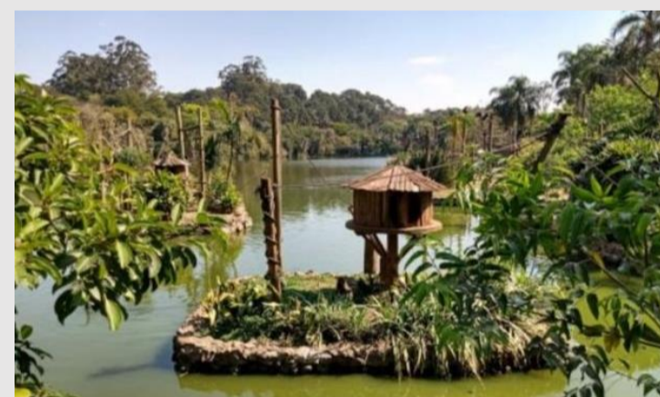
In the picture, area of the São Paulo Zoo.

The Group must take over the spaces within four months. The project provides free tickets for children up to 4 years of age and for students and teachers of kindergarten, elementary and high school in the public school system, on specific days. The right of half price is also guaranteed. The research and conservation of endangered species will continue under the responsibility of the State Government, as well as the conservation areas of The Fontes do Ipiranga State Park.